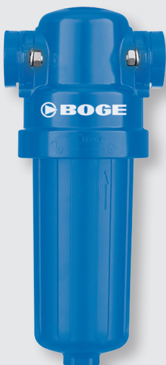
Z 20N - Z 250N