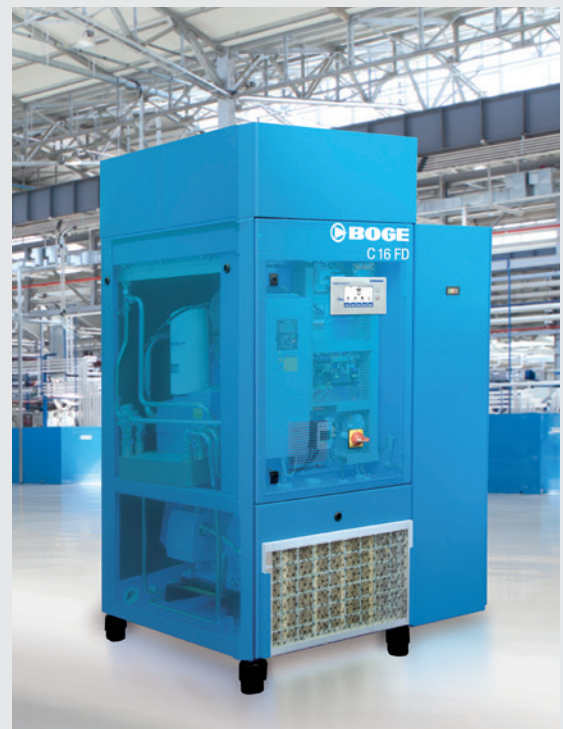
Optimal features and yet compact: the C 16 FD with integrated refrigerant dryer